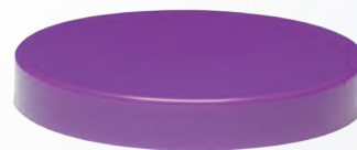
110-400 SM Smooth Side Wall Smooth Top Continuous Thread 110mm Diameter 400 Thread Profile Lined or Unlined