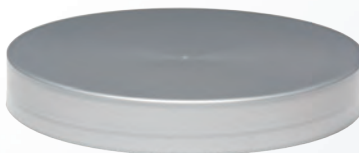
120-400 SM Smooth Side Wall Smooth Top Continuous Thread 120mm Diameter 400 Thread Profile Lined or Unlined