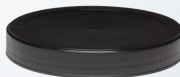
120-400 RB Ribbed Side Wall Matte Top Continuous Thread 120mm Diameter 400 Thread Profile Lined or Unlined