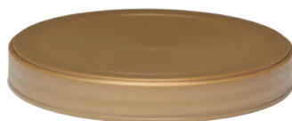
110-400 RB Ribbed Side Wall Matte Top Continuous Thread 110mm Diameter 400 Thread Profile Lined or Unlined