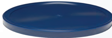
503 Snap Lid Smooth Side Wall Friction Fit 130mm Diameter