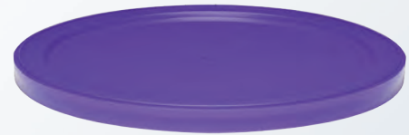
603 Snap Lid Smooth Side Wall Friction Fit 160mm Diameter