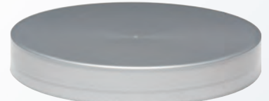
120-400 SM Smooth Side Wall Smooth Top Continuous Thread 120mm Diameter 400 Thread Profile Lined or Unlined