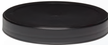
120-400 RB Ribbed Side Wall Matte Top Continuous Thread 120mm Diameter 400 Thread Profile Lined or Unlined